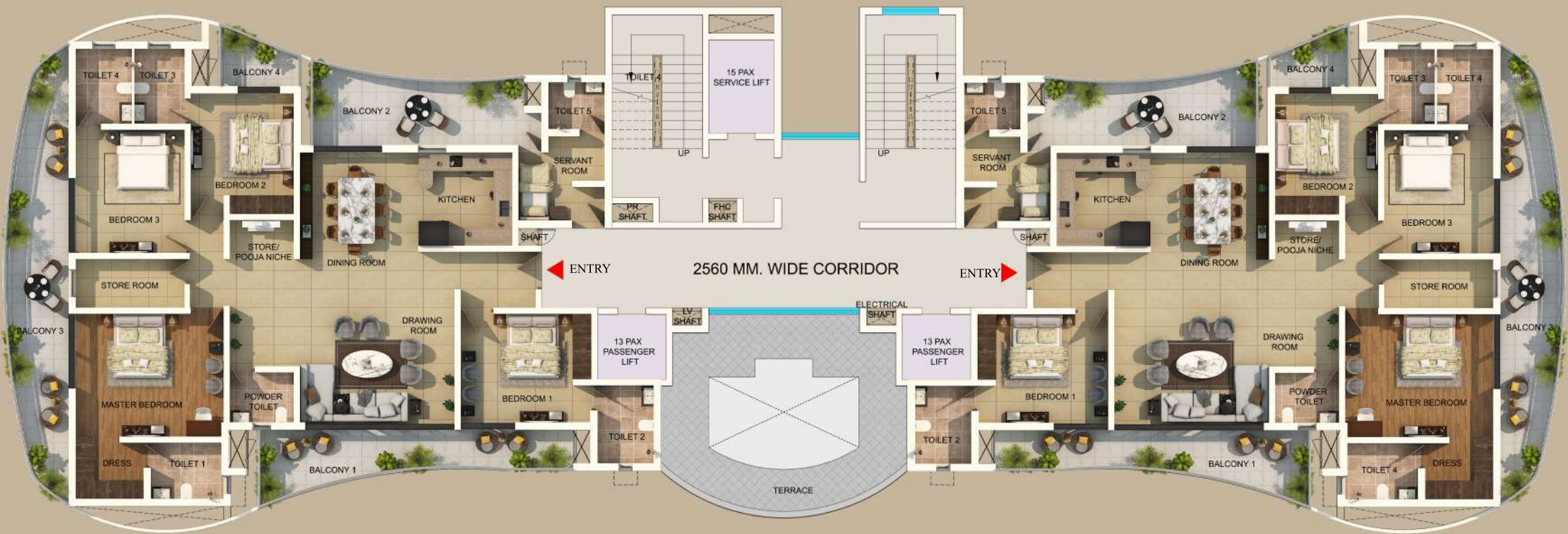
TYPICAL FLOOR PLAN (2 UNIT PLAN)

COMMON TERRACE (3rd,8th,13th,18th,23rd,28th&33rd)