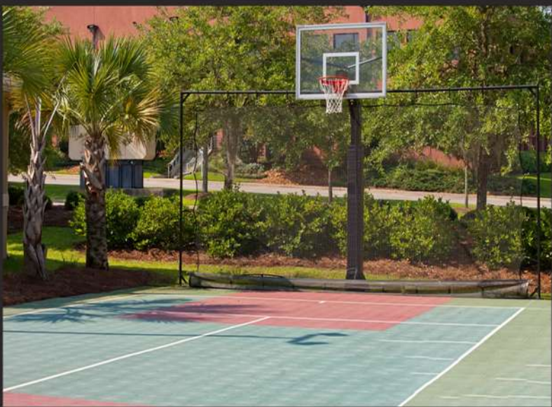
HALF BASKETBALL COURT

Kid's Play Area • Dedicated space for safety and fun. • Features swings, slides and a sand pit. • Encourages children to play and explore securely.