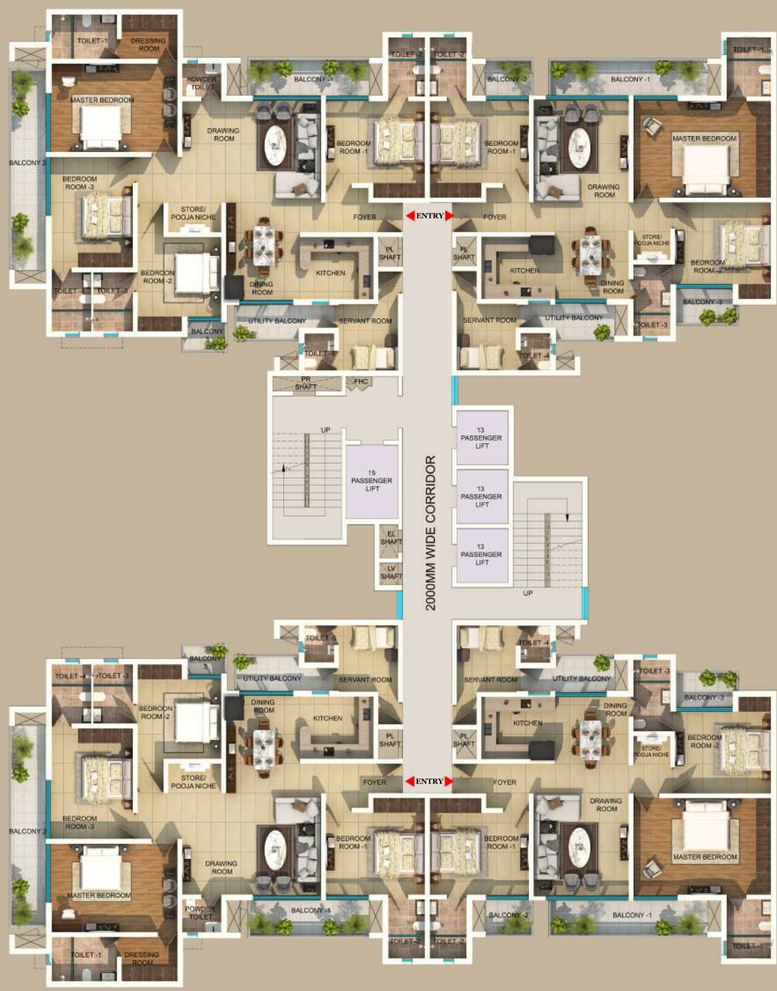
4 BHK (2 UNIT)