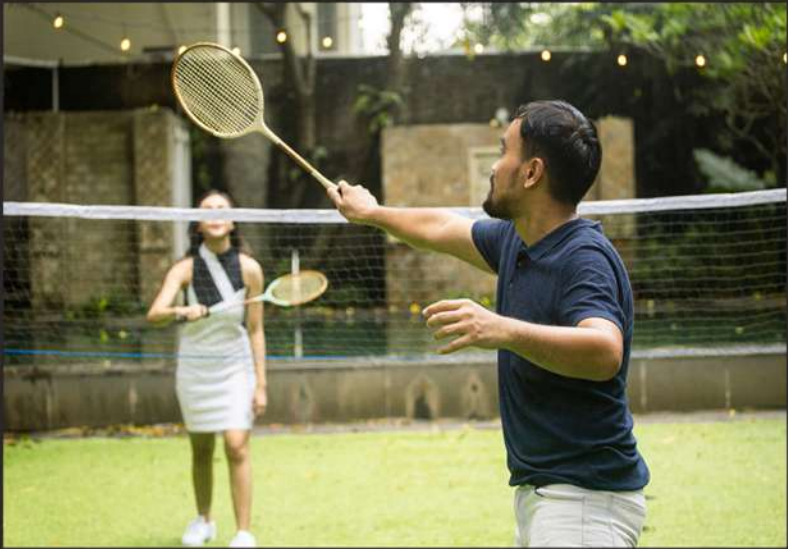
TWO BADMINTON COURTS

Gazebo Seating • Tranquil retreat for relaxation. • Ideal for rendering and enjoying nature. • Suitable for quiet moments or casual gatherings with friends and family or hosting events and small gatherings